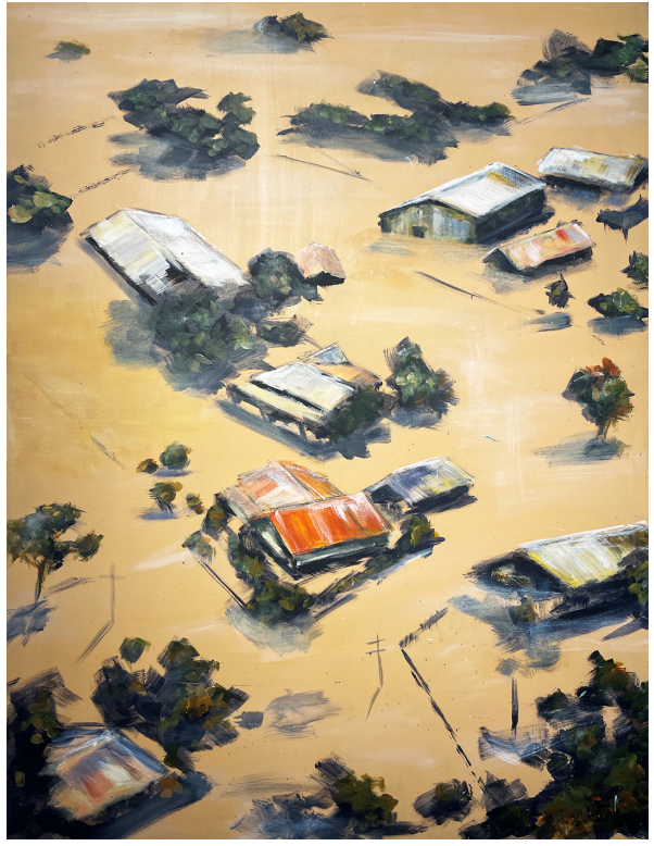
The Australian dilemma, praying for Lismore. Rick Cochrane, 2021. ◆

Floods are generally associated with increased incidence of vector-, food- and water-borne diseases due to increased abundance of mosquitoes, water and food contamination, and compromised hygiene and sanitation services. For example, gastrointestinal disease and leptospirosis cases were recorded after floods in England and Hawaii. River