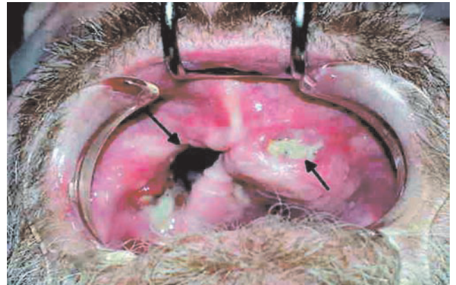
The oral cavity showing exposed necrotic maxillary bone and a large oro-antral communication.