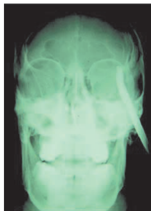
2: Skull x-ray showing the position of the antenna.