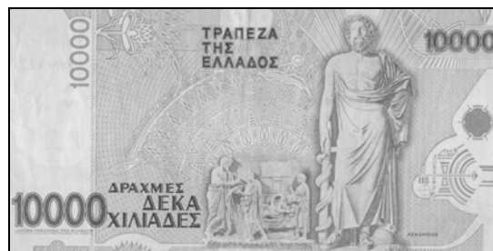
B. The reverse side of the 10 000-drachma note, showing Asklepios, the god of healing, with his symbol, the staff with a serpent coiled around it. Beside him, a healing scene depicts a sacred snake licking or biting the right shoulder of a sleeping patient.