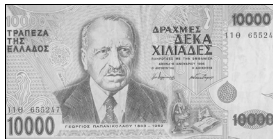
A. The front of the 10 000-drachma note, showing George Papanicolaou (1883–1962), with his microscope and famous Atlas of exfoliative cytology , published in 1954.