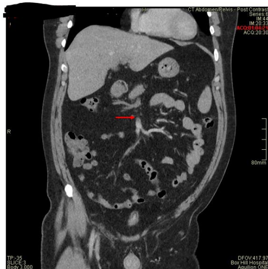
Figure 1a. CT-venogram at presentation showing filling defect of portal vein, contrast in superior mesenteric vein and its tributaries (red arrow, coronal plane)