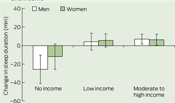
3 Mean changes in sleep duration from 1992 to 2006 by sex and income*

* Means were adjusted for sampling during weekends and different seasons; error bars indicate 95% CIs.