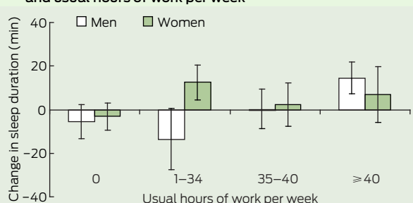
4 Mean changes in sleep duration from 1992 to 2006 by sex and usual hours of work per week*

* Means were adjusted for sampling during weekends and different seasons; error bars indicate 95% CIs.