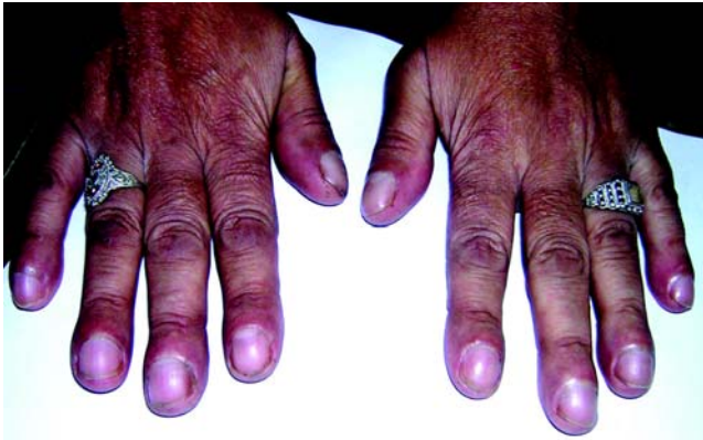
1 Cyanosis and clubbing in a patient with Osler-Weber-Rendu disease