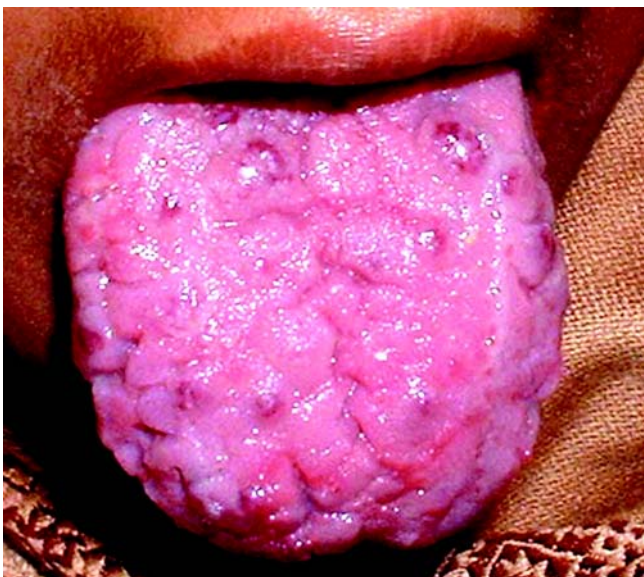
2 Tongue telangiectasia as a manifestation of the disease