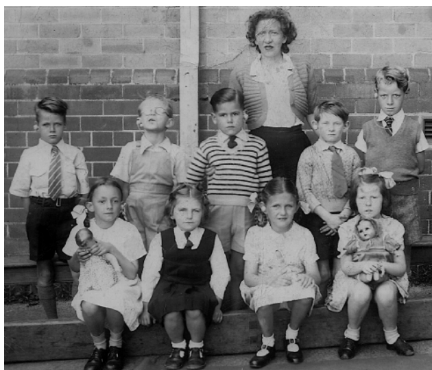
School class of deaf children and their teacher in 1948, with four of the subjects described in this review (used with the kind permission of the owners of the photograph).