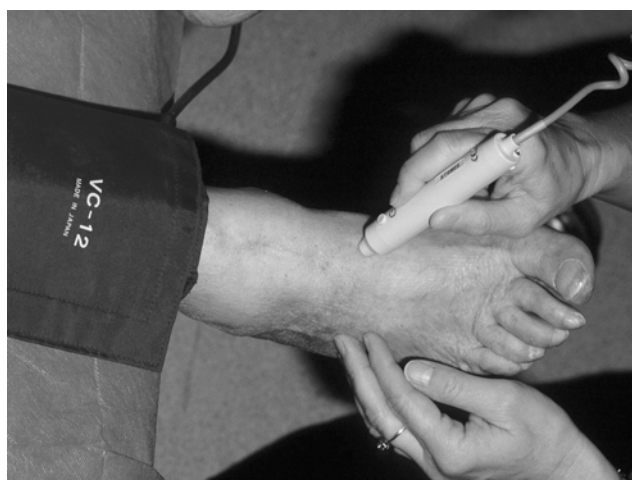
(a) Hand-held Doppler probe being used to measure systolic pressure in the dorsalis pedis pulse.