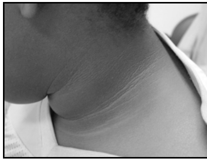
An abnormally increased thickening and pigmentation of the skin in skinfold regions, which can be associated with obesity and high insulin levels.

significant in both the Indigenous and non-Indigenous groups (Box 2). Overall, the rates were higher in the Indigenous population compared with the non-Indigenous population.