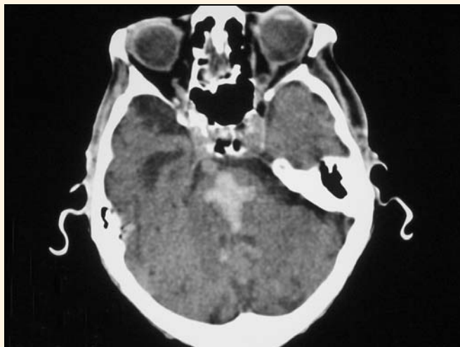
Chris J O'Donnell

The image is a non-contrast axial computed tomography scan of the brain, showing haemorrhage into the central pons.