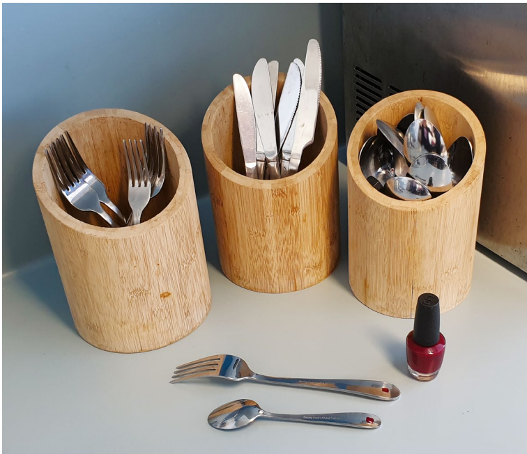
1 Examples of marked cutlery introduced into the tearoom cutlery stands

Care Services, seems an appropriate usage of departmental resources given the benefits that it is likely to have on health: inability to eat meals at lunchtime could lead to afternoon fatigue and decreased work efficiency; 6 using spoons instead of forks to eat, for example, salad, could lead to damage to teeth and also to increased spillage, which would have an economic and possibly workplace health and safety impact, given the possibility of slippage on foodstuffs and the need to clean up any spillage. Other conceivable benefits would be to work productivity through increased morale and decreased corridor inquisitions about who took the fork” (personal communications, 20 August 2019).